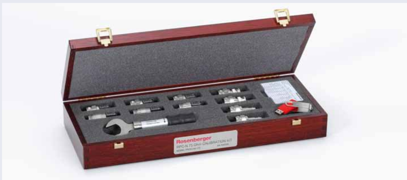
RPC-N 75 \Omega Calibration Kit